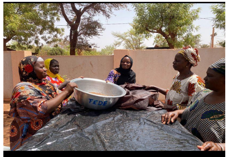
Technical training sessions for young people and women to prepare for the IGAs.