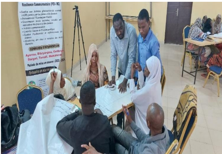
Training on PVE, Gender and Development.

GCERF will mobilise and invest up to USD 10 million – in the Sahel region – to meet these objectives in a minimum period of three years. GCERF will prioritise resilience and prevention programming, including cross-border projects, that meet these objectives – all within the scope of regional and national NAPs and equivalents in order to achieve its overarching objective of supporting stability and resilience.