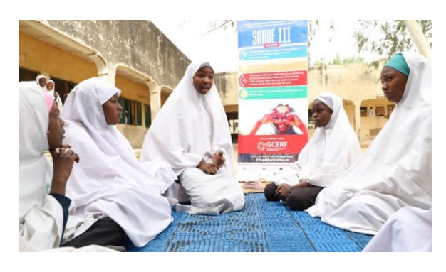
Peace Clubs develop peace agents/ambassadors to promote peaceful coexistence in their communities.