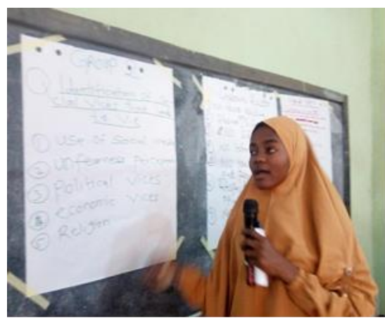
Female teacher presenting group work activity during the teachers training